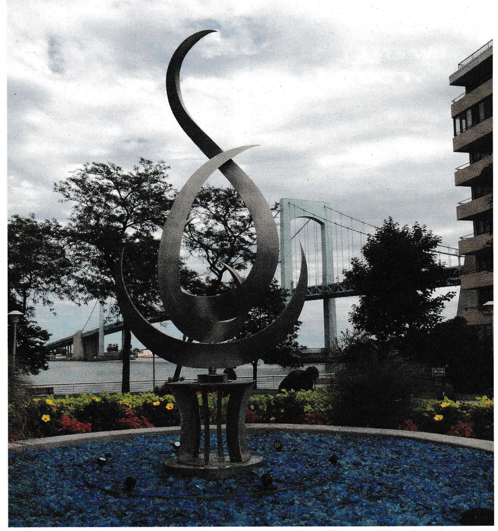
Laxman's Anahata sculpture in Beechhurst, NY