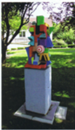
"Dancing in the Rain" by Herat Sommerhoff in Leonia.

As they envisioned sculptures sprouting up all over town