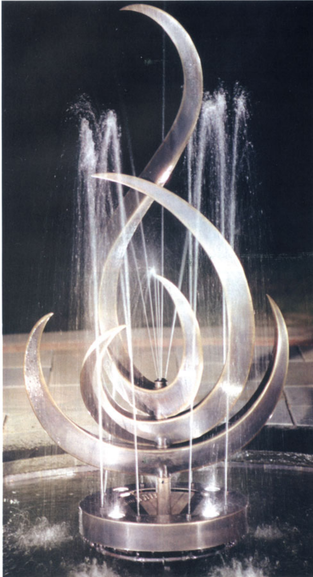
A gorgeous bronze fountain made by Eric Laxman.